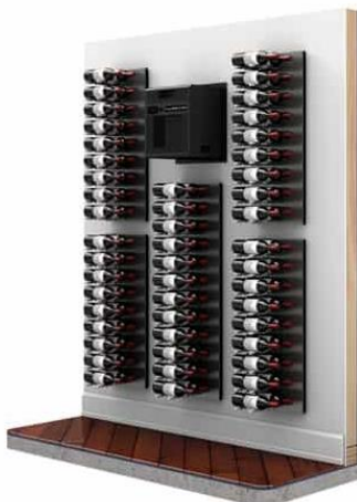
Wall mounted system

*Dimensions not to scale. Concept only, refer to other images for grill appearance.